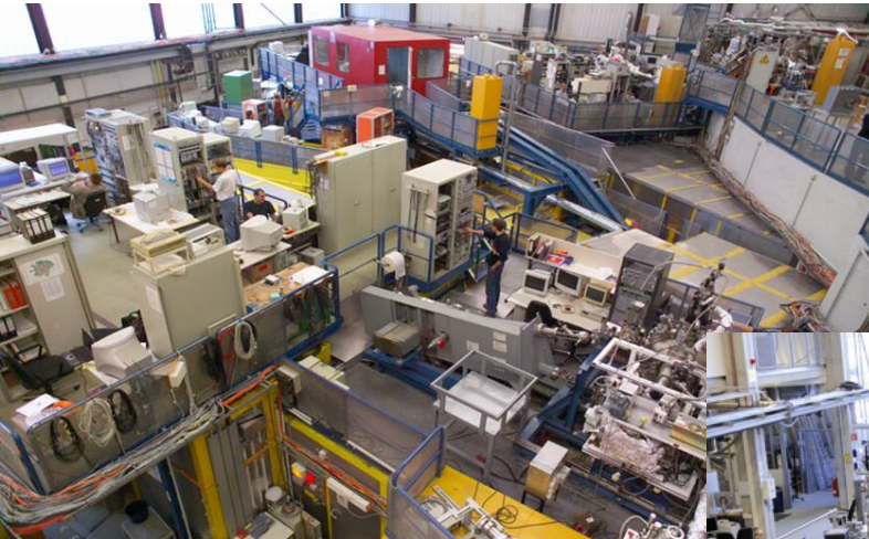
FLASH: 5 BLs, 180 eV